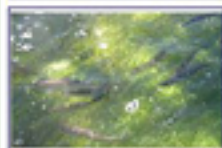
Blue Back Herring